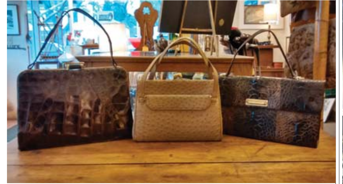
Vintage handbags in exotic leathers at Cuesta Antiques in Lafayette.